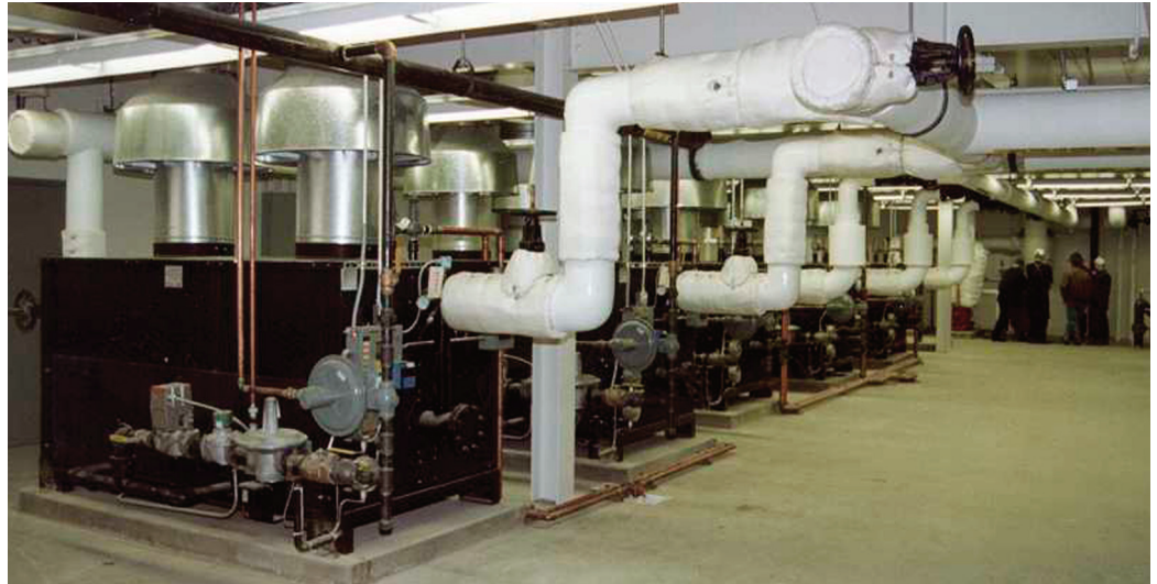
The Parker bent steel tube, all welded construction is the ideal boiler for high temperature applications. Pictured is the Boiler Room at HMT Technology Corp. in Eugene, Oregon. Here, two T-4600's provide the heat source for a metal plating line (350°F), and three T-6800's serve the building heating needs of the facility.

PARKER BOILER CO. 5930 Bandini Boulevard Los Angeles, CA 90040 Tel (323) 727-9800 Fax (323) 722-2848 www.parkerboiler.com BROCHURE 201-HTHWB 111