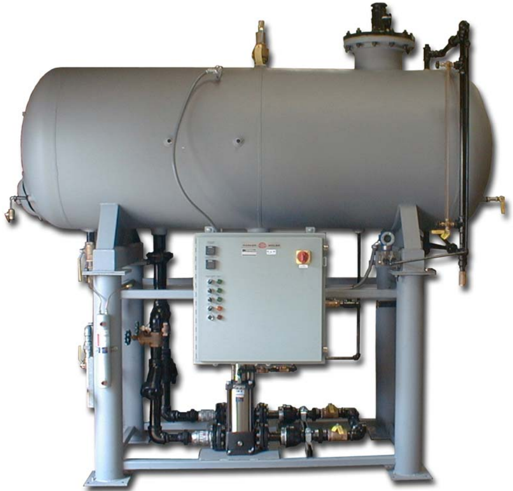
Parker DAS (Spray Type) with Manhole, Sample Cooler & Burks Pump Options