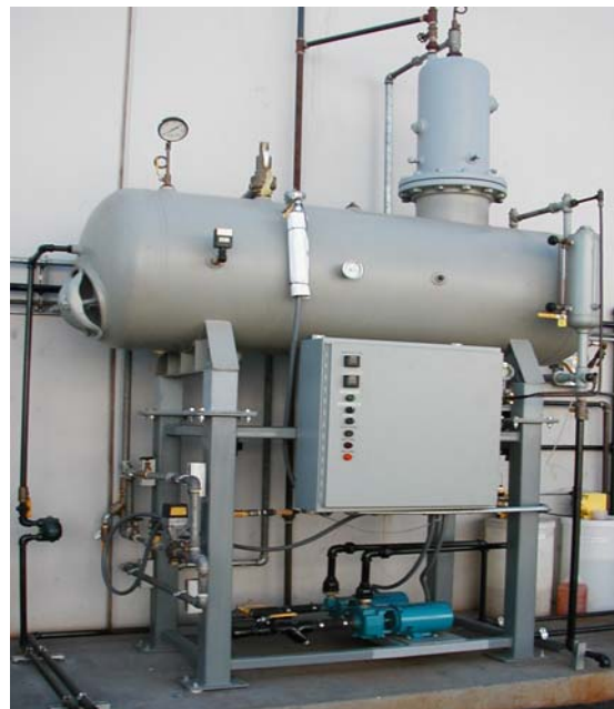
Parker DAT3072 with Manhole, P4 ,& Burks Pump Options

The water level control is based on an electronic water level sensor and controller, which generate a 4-20 milliamp signal to an electronic modulating make-up valve. The steam is controlled in a similar manner via a similar controller and is based on temperature in the vessel; this controls an electronic modulating steam make-up valve.